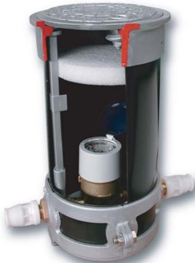
WSC-R CUSTOMER ACCESS