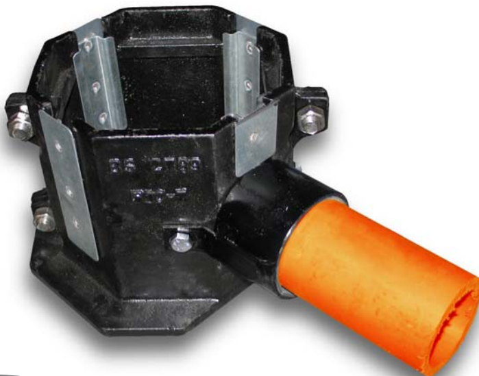
*duct not included

[eg. traffic counting / automatic vehicle recognition / car park access]