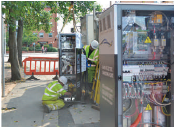
7. Unit commissioned