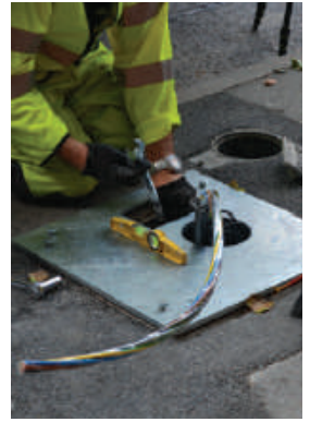
5. Adapter plate secured