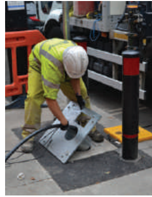
4. Cables pulled through