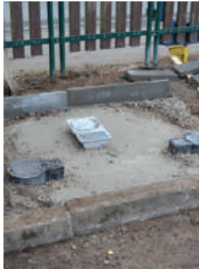
2. RS socket installation