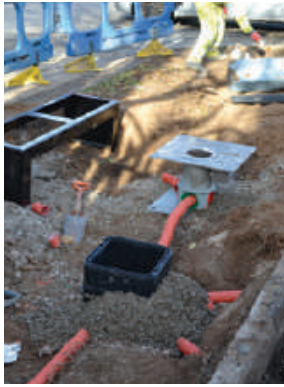
1. Excavation works