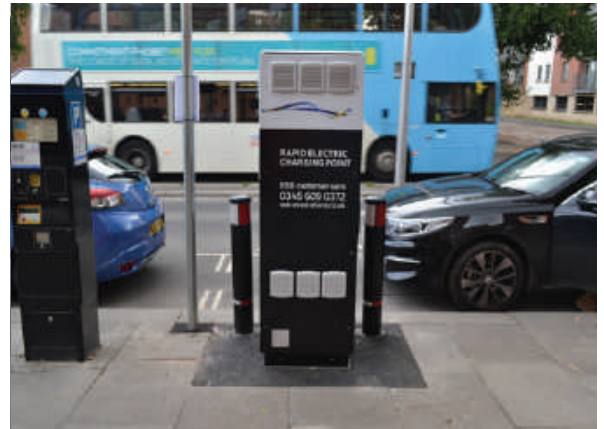
8. Installation completed