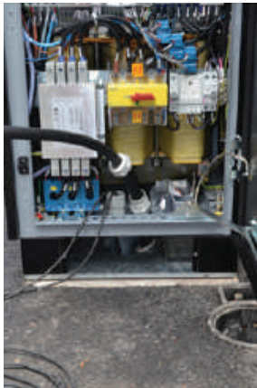
6. Wiring commenced