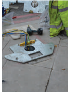
3. Adapter plate inserted