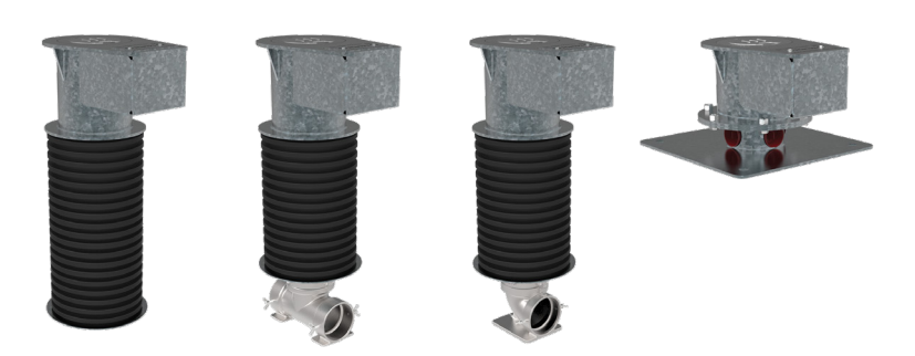
Rs sockets are available in common industry sizes and post installation depths. Base options include: standard [flat] / duck-foot & tee bends for cable access / shallow foundation. RS engineered sockets are made to size, specification and installation requirements.