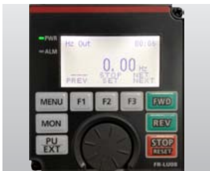
FR-LU08 as full text display with up to fifteen language and real time clock.

The operation panel with the one touch Digital Dial allows direct access to all important parameters. Select the operation panel ideal for your needs. Choose either a LU operation panel with an LCD screen offering enhanced display functionality and a clock function, or a more economical DU operation panel with a 5-digit, 12-segment display.