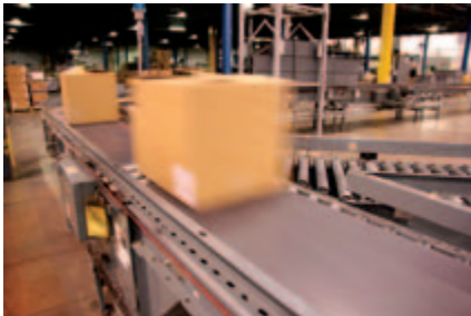
Fast processors due to short response times.