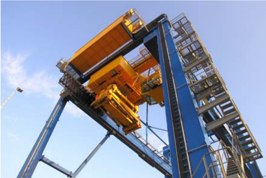
Perfect for crane applications due to built-in 100 % ED Break chopper up to 55 k