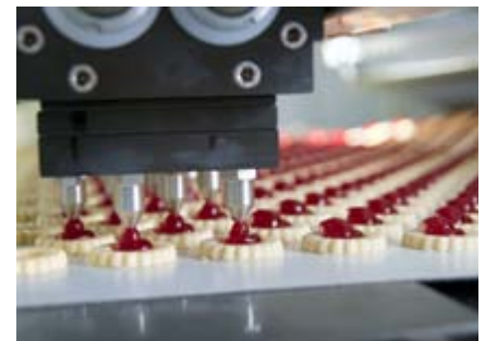
Positioning is one out of many scopes.

By using the built-in absolute positioning function and the built-in high level PLC function, a complete machine can be managed by a stand alone drive. Sensorless positioning is possible with IPM Motors.