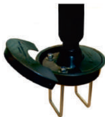
Rebated Base (Reflective only)