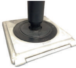
Base Light Adapter (Illuminated & Reflective)