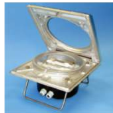
GLOBAL Plus Freestanding