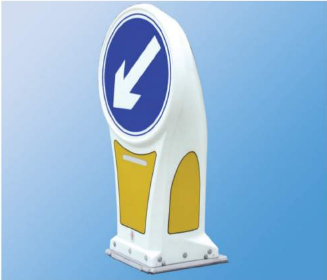
BS EN 12899:2007 Type 1 TTB, IR3, OH2

For approaching 20 years the Contour internally illuminated bollard has been successfully providing essential road information to drivers around the world. Designed to resist tearing and reform with little or no distortion, even after multiple impacts, it reduces the likelihood of damage or injury during a collision. Ideal for roads with high visibility requirements.