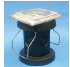
GLOBAL Plus with CABEX