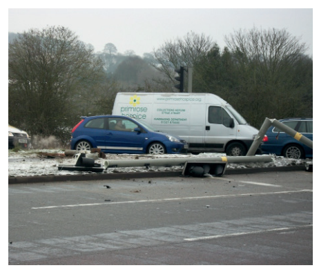
Applications: Passively Safe Traffic Signals, Non-Passive Traffic Signals

The SIS Quad (Sense) enables traffic signal designers to comply with ENI 2767: 2007 by providing full electrical isolation of a traffic signal pole under impact. Each Signal pole is fitted with a small SIS impact sensor. In the event of an impact the sensor provides an output to the SIS Quad monitor board, which in turn activates complete LV and ELV isolation within 0.4 seconds.