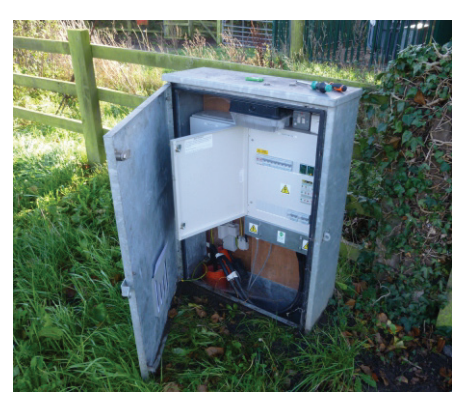
Applications: Street Lighting Columns, Illuminated Signs, Information Signs, CCTV Columns, VAS Signs, VMS Signs

The SIS SOLO (Pillar) has been specifically designed to meet EN I 2767:2007 in its requirement to electrically isolate any item of street furniture containing an electrical supply in the event of an impact. Each structure is fitted with a small SIS impact sensor. In the event of an impact the sensor provides an output to the SIS SOLO monitor unit, which in turn activates complete LV or ELV isolation within 0.4 seconds to the individual structure.