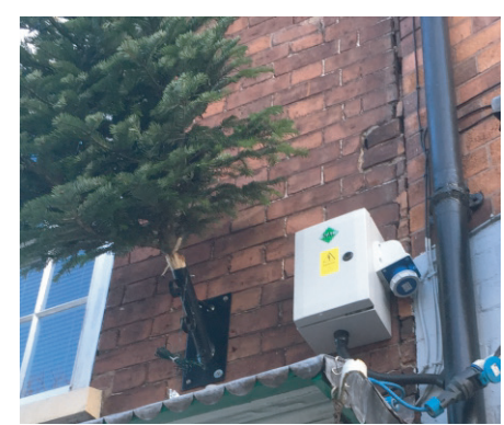
Applications: Market Stalls, Food Vending, Event Lighting

The NAL Power Spur system is a range of lockable IP66 rated enclosures with IP67 rated power sockets which provide safe temporary power to public areas.