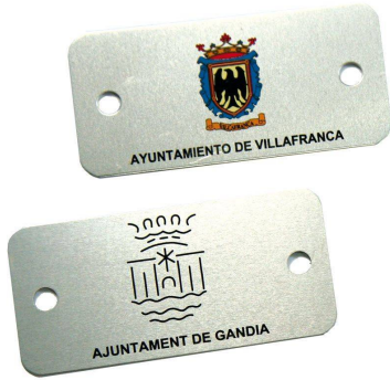
Aluminium plate 74 x 35 mm.