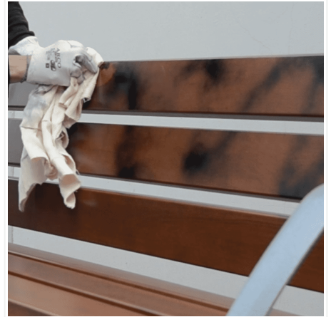
Protector for materials from paints, graffiti