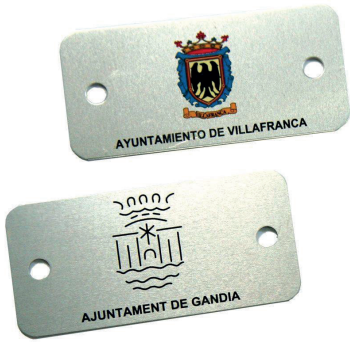
Aluminium plate 74 x 35 mm.